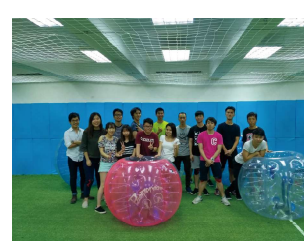
Indoor Bubble Soccer (May 2017)

2 off-campus activities (wargame, bubble soccer) were held to enrich students' social experience.