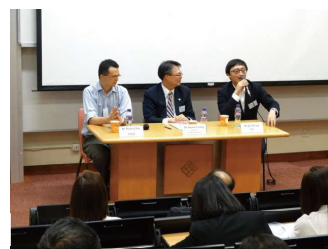
CityU & LU (June 2016)