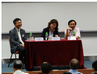
HKBU & PolyU (June 2015)

The seminars provided a platform for researchers, scholars, GE practitioners, policy makers and administrators to review and share experiences with regard to the design and development, implementation, delivery and evaluation, transferability and recognition of their GE curricula. Contents of each seminar are available at the project website.