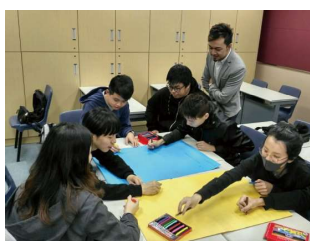
Onsite Student Workshops (March - May 2017)

After months of planning, we are happy to announce the launch of DYJ centralized support services! Between this March and August, we appointed Baptist Oi Kwan Social Services to provide onsite student workshops, teacher training, and off-campus outings for 7 DYJ providers.