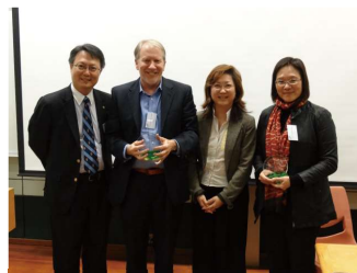
HKU & CUHK (December 2015)