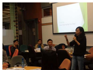
Attention Deficit/Hyperactivity Disorder (January 2017)

Teachers used drawing to demonstrate the meaning of 'engineer' - a visual instruction to support students with SpLD.