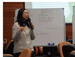
Autism Spectrum Disorder (February 2017)