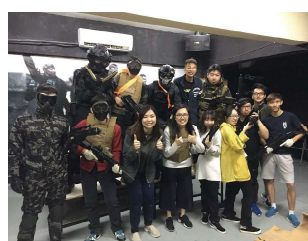
Indoor War Game (May 2017)

Students designed quotes to enhance their study motivation.