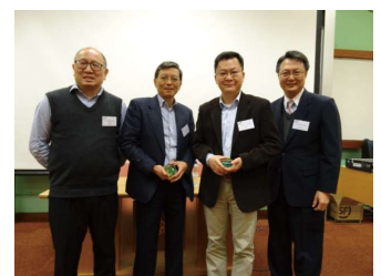
HKUST & EdUHK (January 2017)