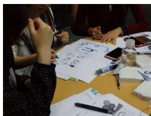
Specific Learning Difficulties (December 2016)